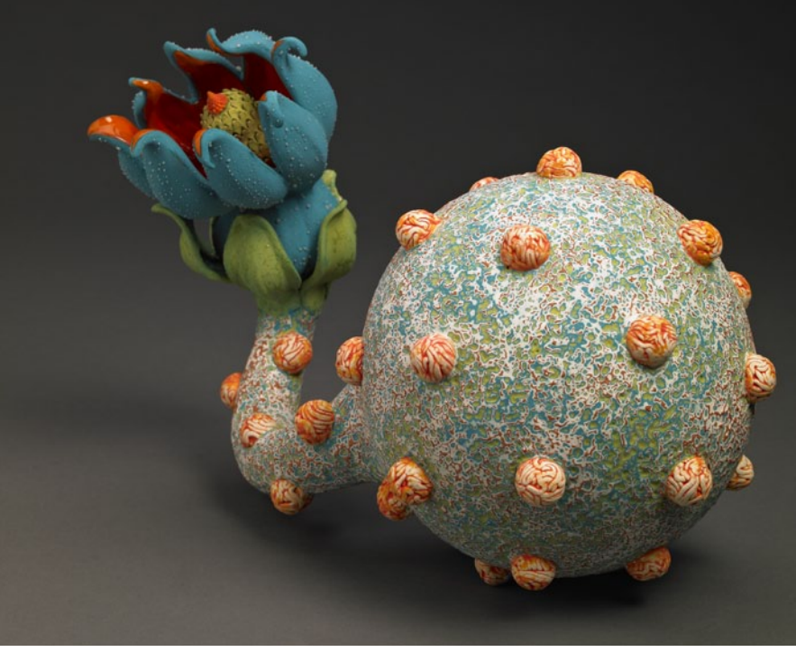
Facing page, top: Aurlia Gouthroii Raphanus 2. 2013. Terracotta, handbuilt and press moulded with slips, underglazes and glazes. 9 x 17 x 9 in. Facing page, below: Aurlia Gouthroii Barnacles. 2011. Terracotta, handbuilt and press moulded with slips, underglazes and glazes. 7 x 17 x 7 in. Above: Aurlia Gouthroii Blastula. 2011. Terracotta, handbuild and press moulded with slips and underglazes. 8 x 14 x in. Below: Aurlia Gouthroii Blastula (Detail).

In her latest series, Gouthro's sculptures serve as a portal into an alternate universe as she pushes beyond the boundaries of reality. Using existing botanical nomenclature, she has given birth to a unique species of plant/animal hybrid and named them after herself in keeping with the scientific practice of