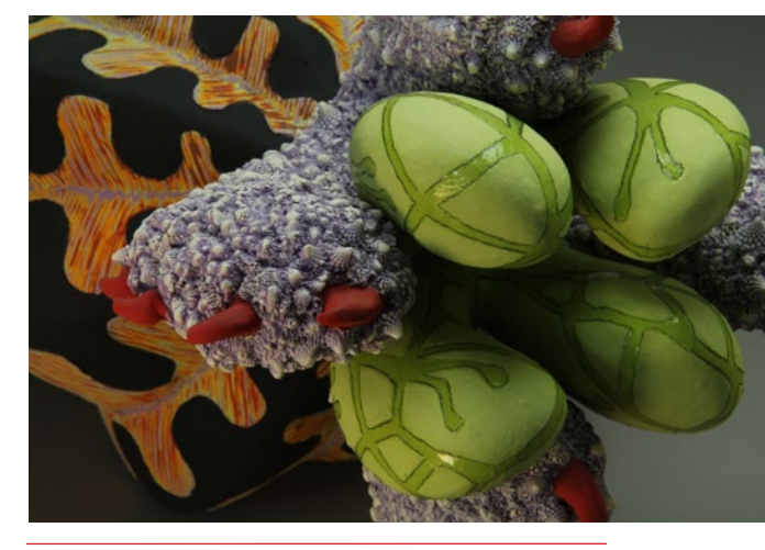
Judy Seckler is a Los Angeles-based magazine writer, specializing in art, design and architecture. (www.judyseckler.com) (www.twitter/judyseckler). Her previous three reviews for Ceramics: Art and Perception were "Loving Cups" ( An Ocean in a Cup ); "Snap! Crackle! And Pop!: Raku on the Edge " and "Wall-Paper: Domesticity Deconstructed" (Issue 92, July / August 2013).